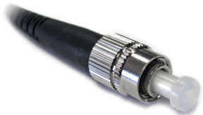
Multimode FC Connector

OPTiFab's FC Connector is a threaded cylindrical connector. It is designed to hold secure and remain stable in high-vibration environments and is used in most areas of a fibre network. It is constructed from nickel plated metal and features a keyway for correct alignment.